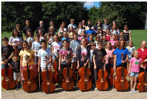
The 2014 Course

“Thank you for a wonderful course: my son got so much out of it, and it was really uplifting at the concert to see so many young people making music. We were very impressed by the whole set-up, both musically and the social atmosphere you’ve created. My son is already looking forward to next year!”