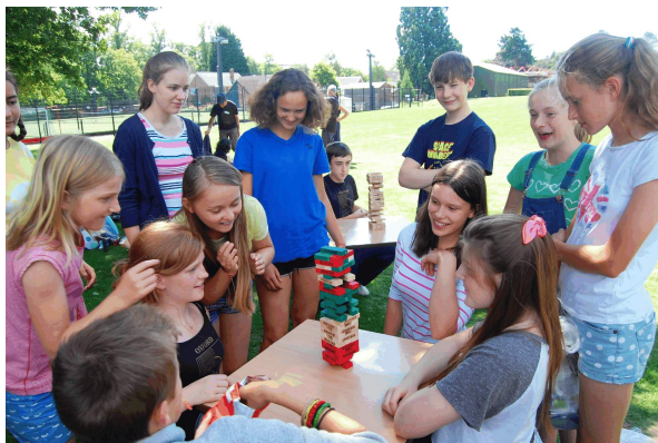
Jenga Tournament 2014