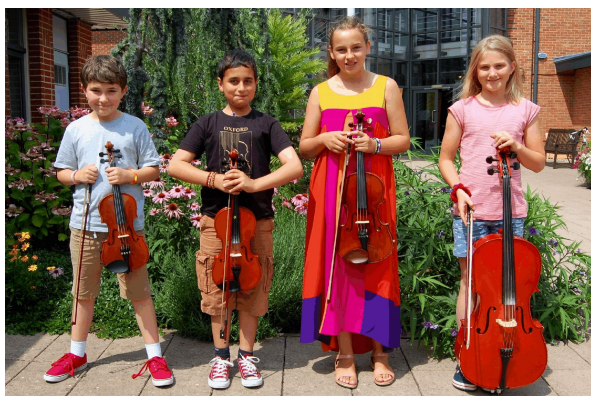
Introductory Course quartet