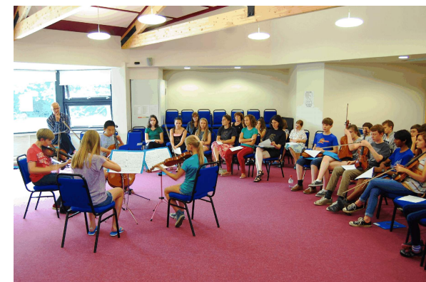
Advanced Course masterclass