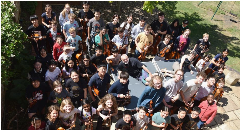
The 2024 Course

Wychwood School, Oxford 2 nd – 8 th August 2025