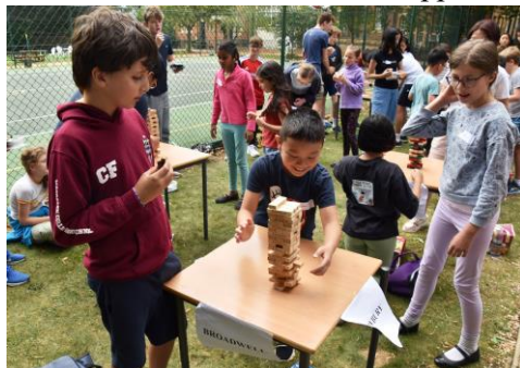
Jenga Tournament 2024

All members of all three course tiers will play in two different chamber groups, as well as a chamber orchestra made up of everyone in their course tier. There will also be a Lower Orchestra, consisting of all the players on the Introductory and Intermediate Courses, and an Upper Orchestra, which combines all the players on the Intermediate and Advanced Courses.