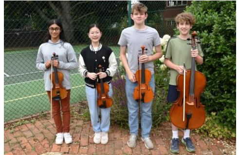
Intermediate Course quartet