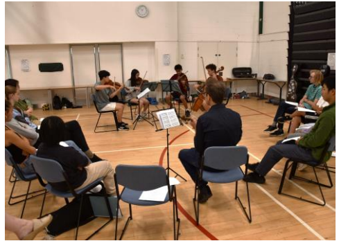
Advanced Course masterclass

* Deposits received by 31 st March 2025 qualify for a £10 Early Application Discount on the balance due. You will also receive a £5 Bring-A-Friend Discount on the balance due for every new course applicant who names you as recommender on their application form. This discount is applied automatically to siblings. A deposit of £200 must be paid at the same time as your application: both must reach us by 25 th May 2025.