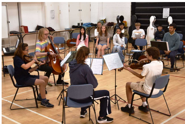
Advanced Course masterclass