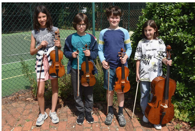
Introductory Course quartet

(Exact timings will be confirmed ahead of the course.)