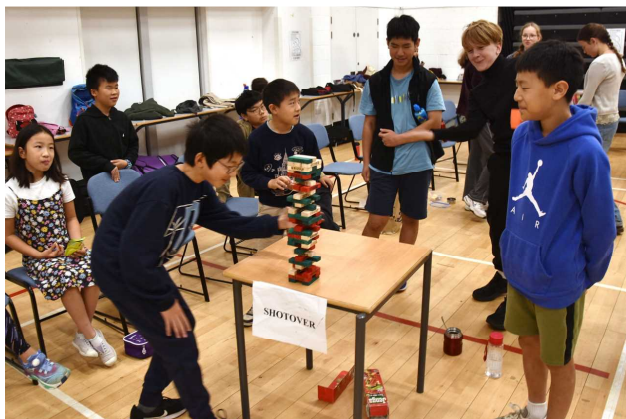
Jenga Tournament 2025

“As parents, we thought the course was extremely well organised and offered a great balance of challenge and fun. The concert at the end was extremely slick, the repertoire was very well chosen, and the playing of a great standard, and it was fantastic for the younger children to have a chance to be part of a sound like the combined orchestra.”