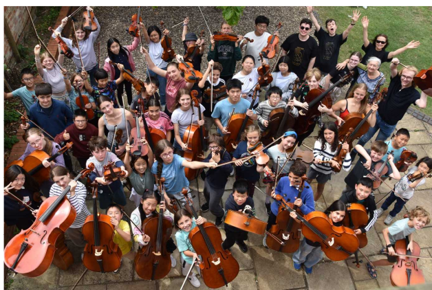
The 2025 Course

Summer music courses for young string players (aged 9–18)