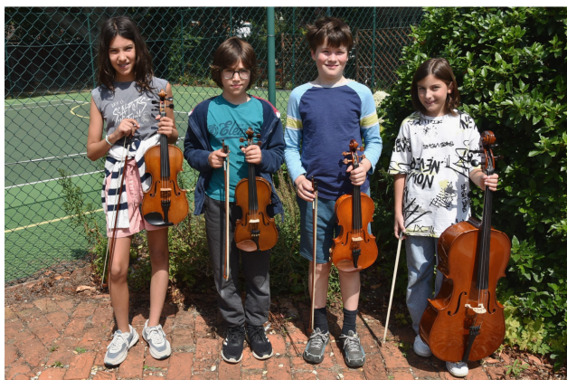
Introductory Course quartet

(Exact timings will be confirmed ahead of the course.)