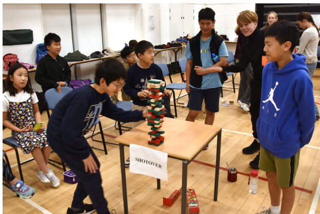
Jenga Tournament 2025

“As parents, we thought the course was extremely well organised and offered a great balance of challenge and fun. The concert at the end was extremely slick, the repertoire was very well chosen, and the playing of a great standard, and it was fantastic for the younger children to have a chance to be part of a sound like the combined orchestra.”