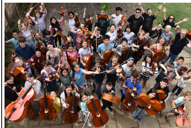
The 2025 Course

Summer music courses for young string players (aged 9–18)