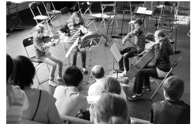
Advanced Course masterclass