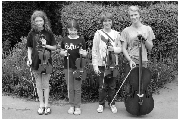
Introductory Course quartet