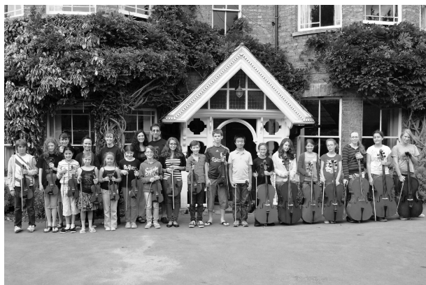
The 2010 Course

“Consistently high quality tuition... friendly and relaxed atmosphere... musical and social activities were perfectly balanced...a wonderful course.”