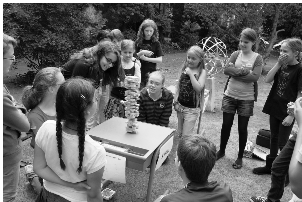
Jenga Tournament Semifinal 2010